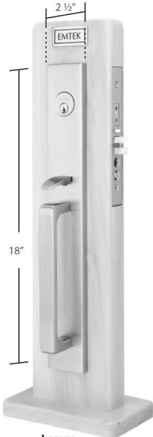
Lugano Trim Style Part # UL 3348